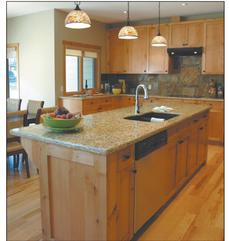
High-quality Bosch dishwashers and Grohe water faucets are a feature of the kitchens.

For more information, call 1-877-349-7575, visit the Spirits Reach show-home or see www.spiritsreach.com .